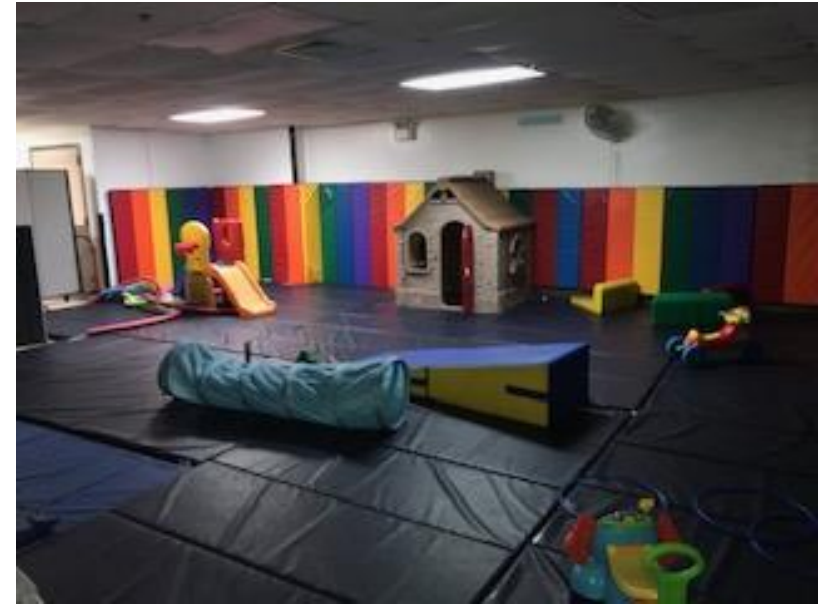
Gross motor activity in our playroom and playground